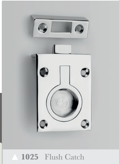
▲ 1025 Flush Catch

A spring loaded Flush Catch with Angle Strike Plate.